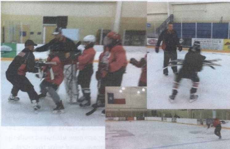
Playing a competitive game with the campers: notice the Texas flag at the end of the arena...

"Dear Lord, today is really a struggle. Heading to College Station, Tx., I seem to hurt physically and it is hard to keep my thoughts focused. Jesus you have made me a new person and I need to let you work through me to your praise and glory. Lord, I pray that I would be a good servant at camp. In Jesus' precious name I pray."