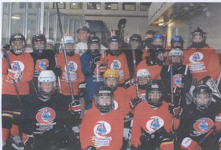
Some of our campers from the Wheaton Chicago Camp

As we got closer to time for camp some things started to happen... our Christian NHL pro was supposed to come to camp for the whole week. But he texted me about 10 days before camp and told me he would not be able to make it because he had decided to go to summer school. I called him on the phone and he agreed to come for one night to speak to the campers and sign autographs but