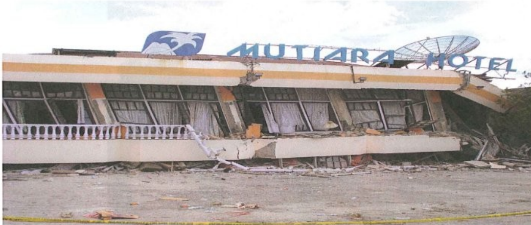
A Three-Story Hotel

The quake triggered mass panic where several buildings were flattened. Weeks later people all over the city are still sleeping outside in tents provided by the government or under tarps. We are still experiencing aftershocks. PRAY that the Lord will give me and others freedom from the anxiety that a trauma like this causes and be able to rest in His care.