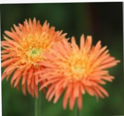
FLOWERS ON CAMPUS