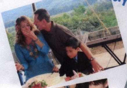
Our birthday bash