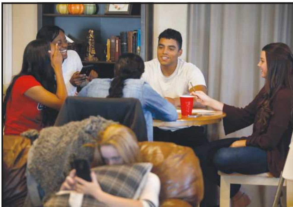
Soldiers relax and mingle Thursday at the Soldier Hospitality House on Chaparral Road in Killeen.