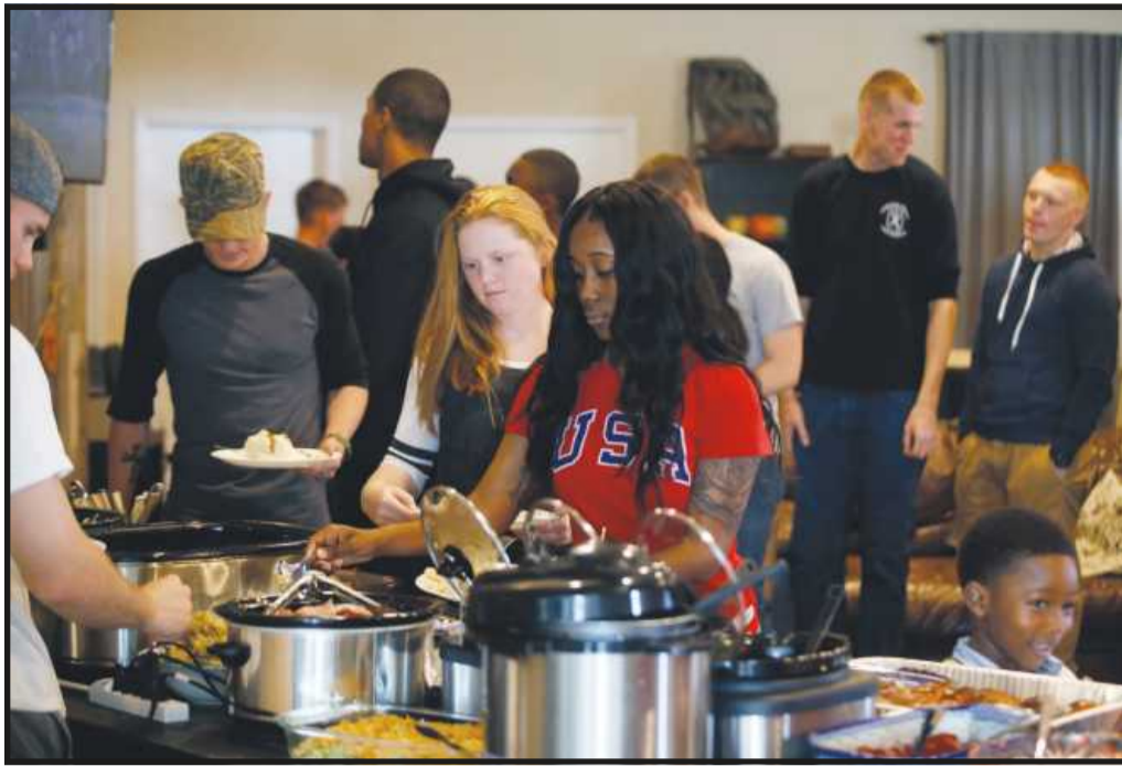
Soldiers prepare to eat a Thanksgiving meal Thursday at the Soldier Hospitality House on Chaparral Road in Killeen.