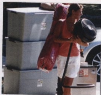
CAMPUS MOVE-IN DAY