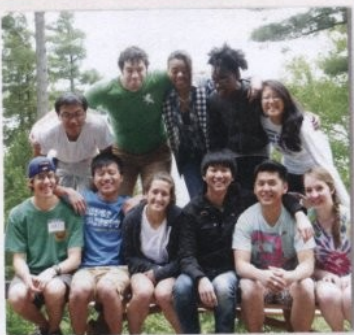
SUMMER LEADERSHIP CAMP