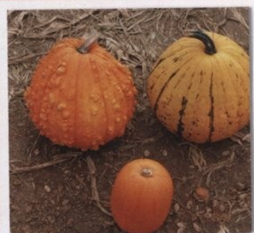
FALL OUTREACH EVENTS